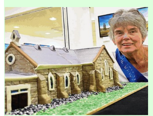
St Enoch's was the inspiration for one of the cakes displayed at the Cake Decorators convention.